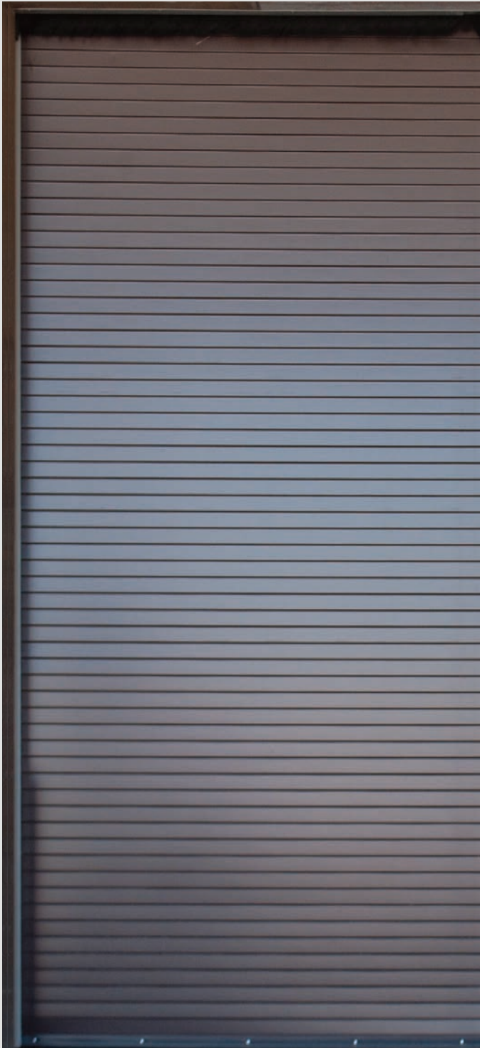
Cover image: Model 610, perforation on top 2/3, bottom 1/3 solid, custom finish